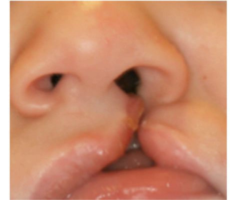
16 weeks progress

The goals of NAM therapy are to reduce the size of the cleft and improve nasal symmetry prior to the initial surgical repair. Stretching the nasal lining provides the surgeon with more tissue for the repair and helps to improve soft tissue nasal esthetics. Note how collapsed the patient's left nasal cartilage appears at birth. Following NAM, the nose is more symmetrical.