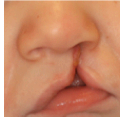
8 weeks progress