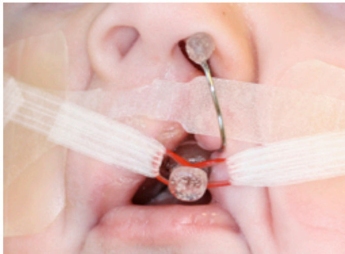
NAM appliance in place : with nasal stent

The goals of NAM therapy are to reduce the size of the cleft and improve nasal symmetry prior to the initial surgical repair. Stretching the nasal lining provides the surgeon with more tissue for the repair and helps to improve soft tissue nasal esthetics. Note how collapsed the patient's left nasal cartilage appears at birth. Following NAM, the nose is more symmetrical.