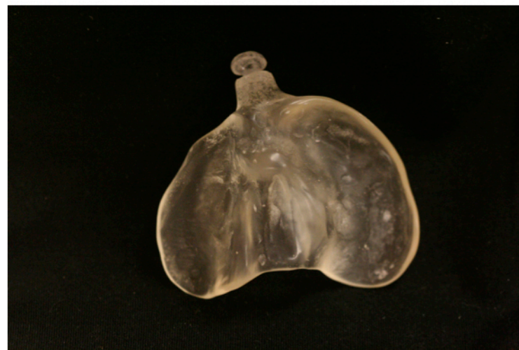
NAM appliance : prior to nasal stent addition